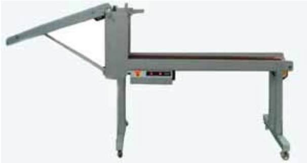
Universal Product Stacker

Fully Automatic Output Product Stacker For Media, Cosmetics, Pharmaceuticals