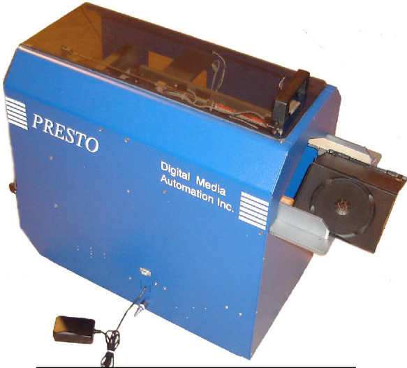
Title Sheet Insertion Module: Semi Automatic When Used Standalone

complete fully automated line consists of five modules. The modules are: Case Opener and Presenter, Slipsheet Inserter, Disc Placer, Booklet Placer, and finally a Case Closer Module.